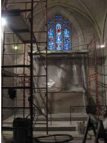
The Chapel will be done by the first of February. The stone has all been cleaned and the mortar and cracks repaired.