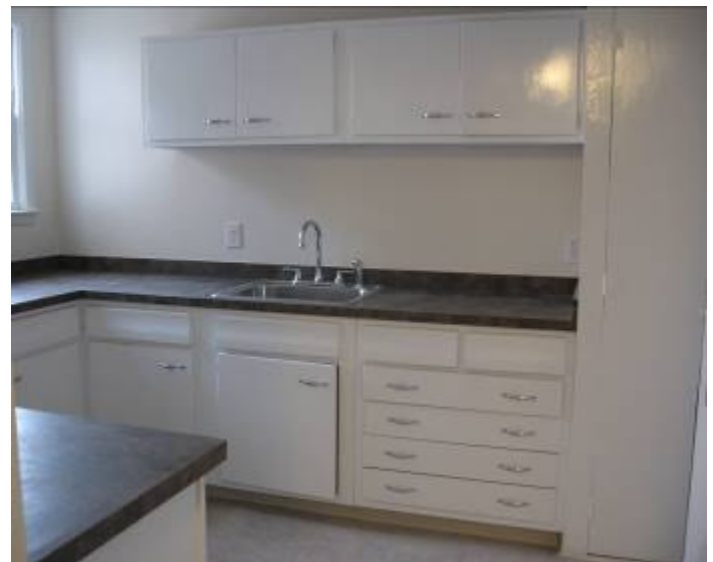
The Sacristy has a new ceramic tile floor. The cabinets have been painted white. There are new under cabinet lights, a new extra-deep sink with swing away faucet, and new counter tops. The vestment cabinet has been enlarged and reconfigured with drawers for the vestments and a shelf above for our sound equipment. The ceiling in the area between the chapel and the chancel had to be replaced as well and the walls painted. It is bright and cheerful.