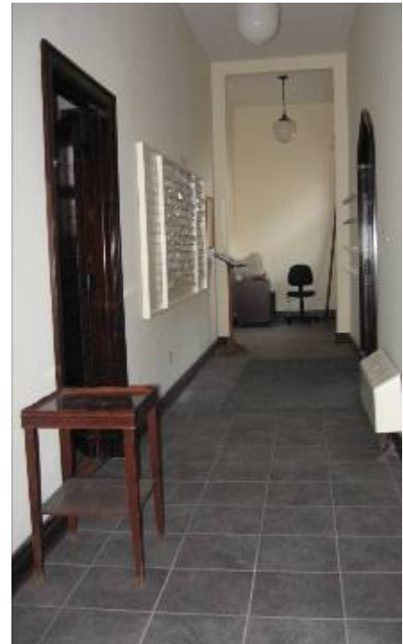
The hall by the office has a new ceramic tile floor. The walls have been painted and the woodwork refinished.